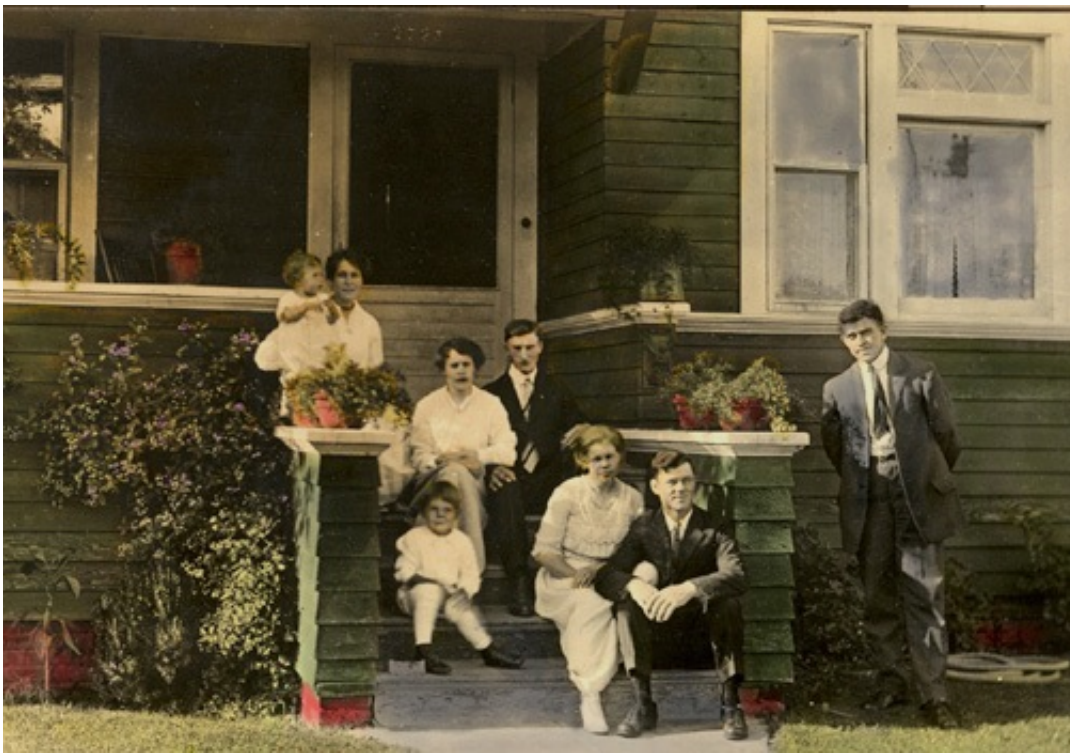
This is my grandparent's home on Dochester Street in Los Angeles, November 1916. The house still stands but the address today is 2725 West 15th Street.