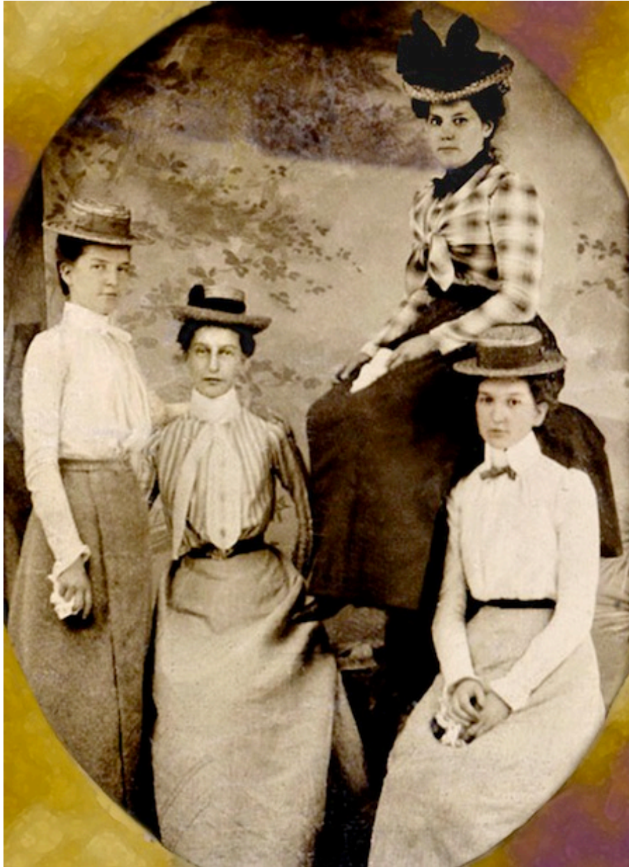
The Gale Girls, circa 1900